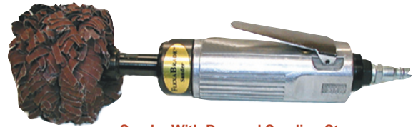
Sander With Dressed Sanding Star

Sanding stars must be dressed* first prior to use in accordance with instructions supplied.