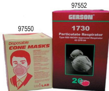
dual support elastic bands

Non-toxic, particle masks passes 50% less than comparable masks. Lightweight, comfortable and disposable.