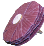
Sanding Star As Supplied