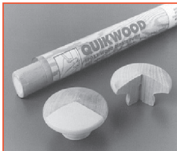
"The Woodworker's Dream"

QUIKWOOD® is a remarkable polymer compound for instant wood repair. Easy-to-use, QUIKWOOD® molds like clay, then dries like wood in 30 minutes. QUIKWOOD® is also great for wood-to-wood and wood-to-metal bonding. QuikWood® epoxy resembles pale-toned unfinished wood. Fills holes, scratches, gauges, cracks, dry rot and knot holes. Packaged in a 2 oz tube.